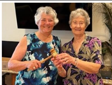
2022-2023 Officers East Contra Costa Historical Society

I look forward to serving as President this coming year to continue the fine work already happening as well as to support the work that all of the many volunteers do to make our ECCHS such a special organization.